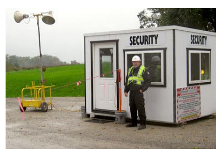
Watching for fire is Not Just security's Responsibility, It's Everyone's Responsibility

In conducting review of numerous fires, the phenomenon of a fire occurring within a short timeframe after the Hot Work operator has left is more frequent than many of the other sources of ignition. Fire watch duties should also include maintaining surveillance for conditions in which heat sources and combustible fuels can result in an ignition.